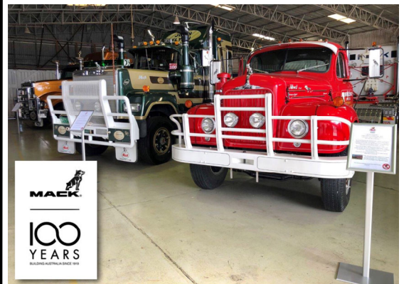
Above: Pop-up Museum in Mack Australia commemorating the 100th anniversary