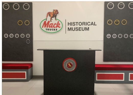
Above: Dealer Member plaques displayed in the Museum lobby

The Museum is funded by donations from Mack enthusiasts, contributions from Mack Trucks Inc. and the Dealer Membership Program. The Dealer Membership Program was created in 2017 to offer dealers the opportunity to support efforts to preserve Mack history. A dealer who chooses to participate in the program is recognized with a plaque on the program wall in the Museum reception area and on the Museum website. Proceeds from the Dealer Member Program have made it possible for the museum to boost our historical document preservation efforts, complete the restoration of the 1945 Mack NM, expand our vehicle maintenance program, and enhance our displays with brilliant artwork and video. Dealer support allows the Museum to focus on future objectives including exhibit display enhancements, maintenance to the Mack AC fire truck and continued work on record retention and collection preservation.