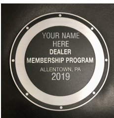
Above: Sample Dealer Member plaque

We currently have 27 Dealer Members. For more information or to become a member of the Dealer Program, please complete the membership application located on the Truck Dealer Portal or call the museum.